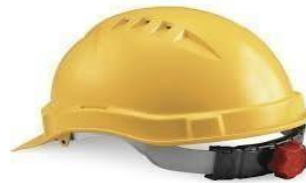
SAFETY HELMETS (Yellow)