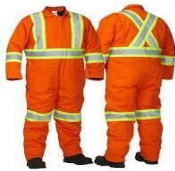
WORKERS UNIFORM (ORANGE)

unloading etc. including testing charges shall be borne by the contractor.